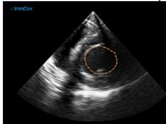
Dec 30: 2336