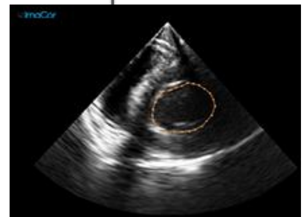
Dec 31: 0042